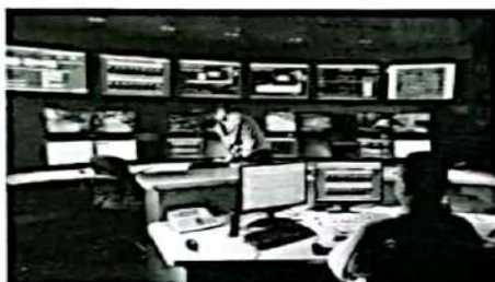
command and control center